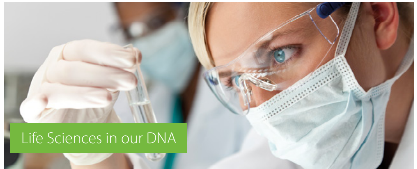
Life Sciences in our DNA

INRALS provides a platform for international collaboration. INRALS members participate in international tenders, have quick access to an international network of recruitment professionals and candidates and exchange knowledge and expertise in recruitment, selection and outsourcing.