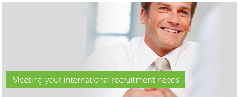
Meeting your international recruitment needs