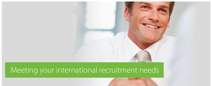
Meeting your international recruitment needs