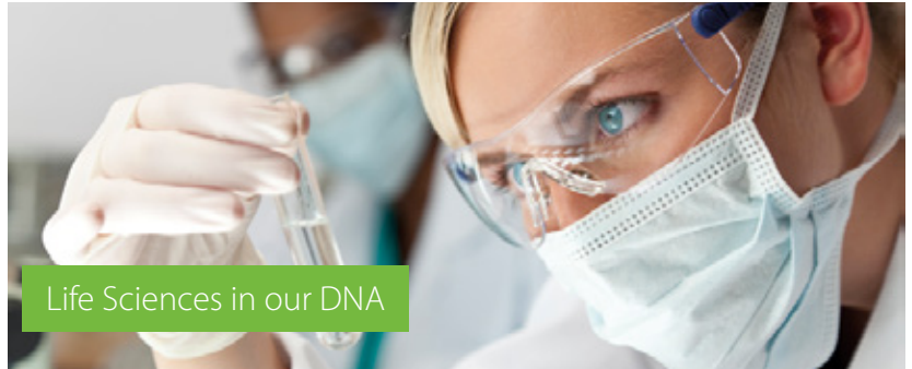
Life Sciences in our DNA

INRALS provides a platform for international collaboration. INRALS members participate in international tenders, have quick access to an international network of recruitment professionals and candidates and exchange knowledge and expertise in recruitment, selection and outsourcing.