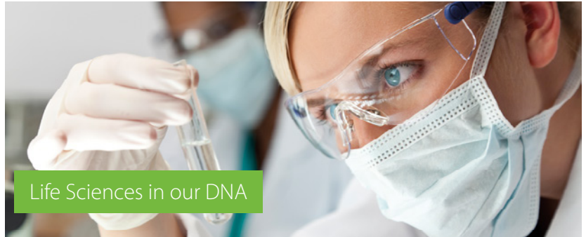
Life Sciences in our DNA

INRALS provides a platform for international collaboration. INRALS members participate in international tenders, have quick access to an international network of recruitment professionals and candidates and exchange knowledge and expertise in recruitment, selection and outsourcing.