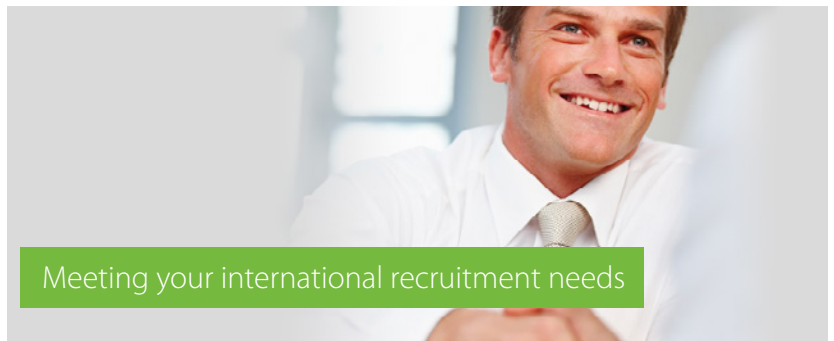
Meeting your international recruitment needs